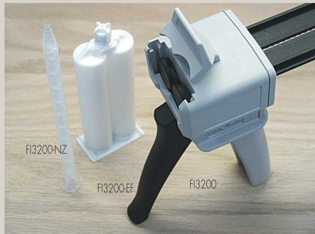
F13200-NZ Nozzle Designed to distribute a 1:1 Mixture